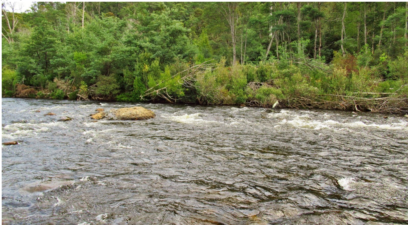
The upper reaches of the Mersey River was the best area to fish.

is in very poor condition as well, standing up in the river is bad enough let alone catch a trout. Cormorants were in large numbers in this area too as they have been now for several years. I didn't even bother to fish the Liena area this season as it dropped off from mid season back in 2018/19. I found the best stretches of water to fish was the Weegeena area, the trout were in reasonable numbers there and in very good condition. The majority of trout were small to medium fish with the odd ones caught up to 705 grams, I did see & had a few follows from several larger trout in the area as well.