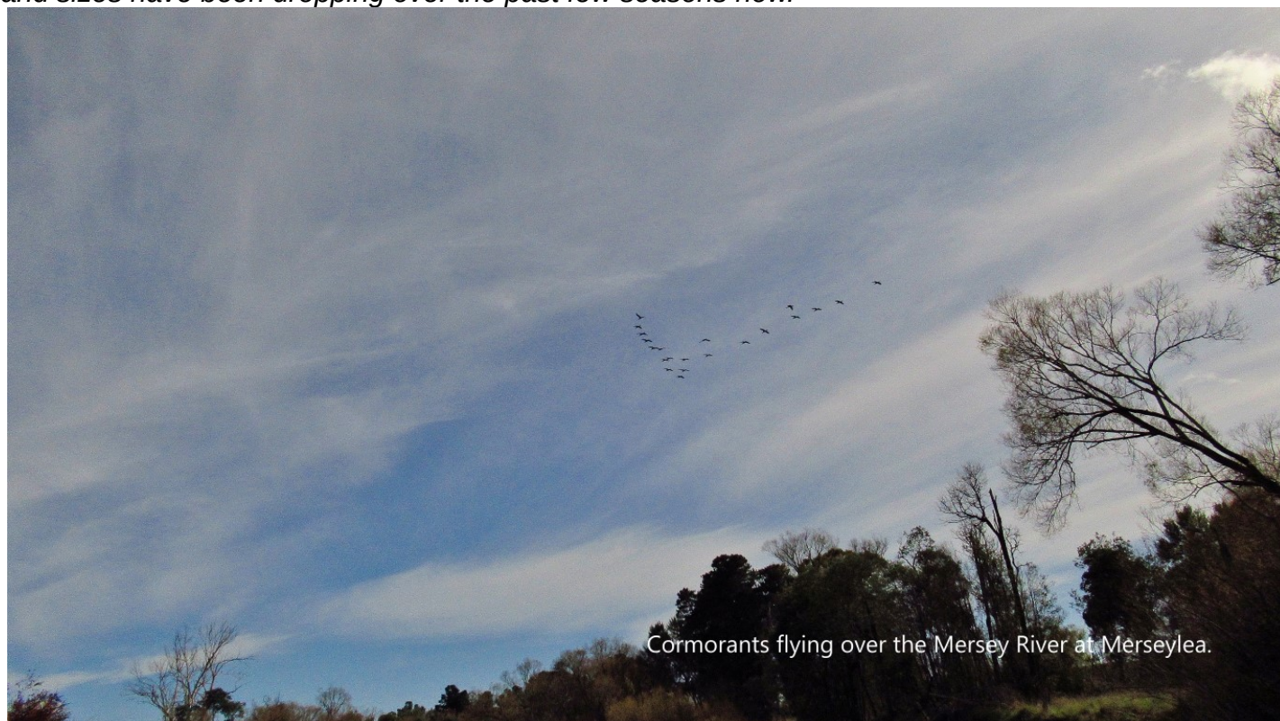
Yes, that's Cormorants flying over the Mersey River at Merseylea..

biggest disappointments this season was the lack of rainbow trout in the Mersey River, their numbers and sizes have been dropping over the past few seasons now.