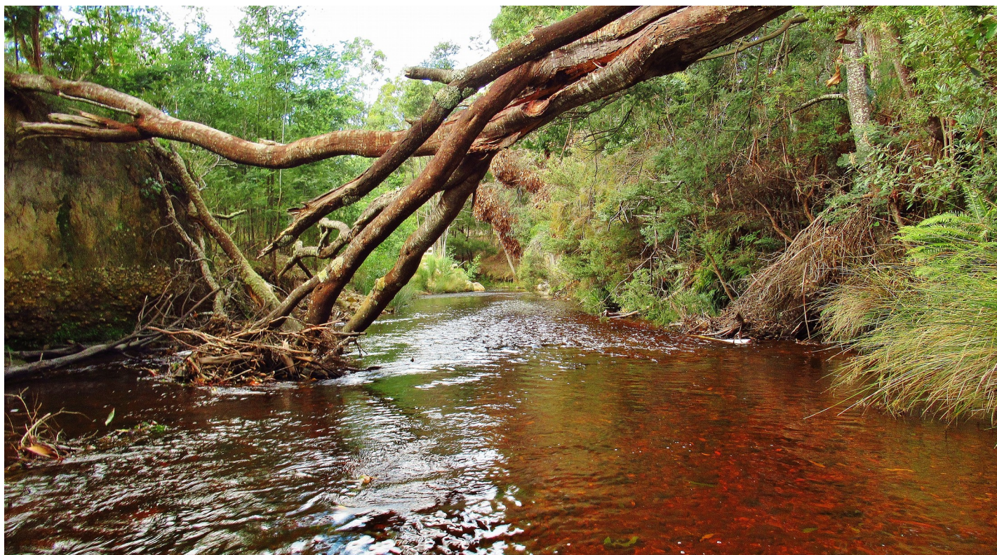
The Dasher River , good flowing water on the last day of the trout season.