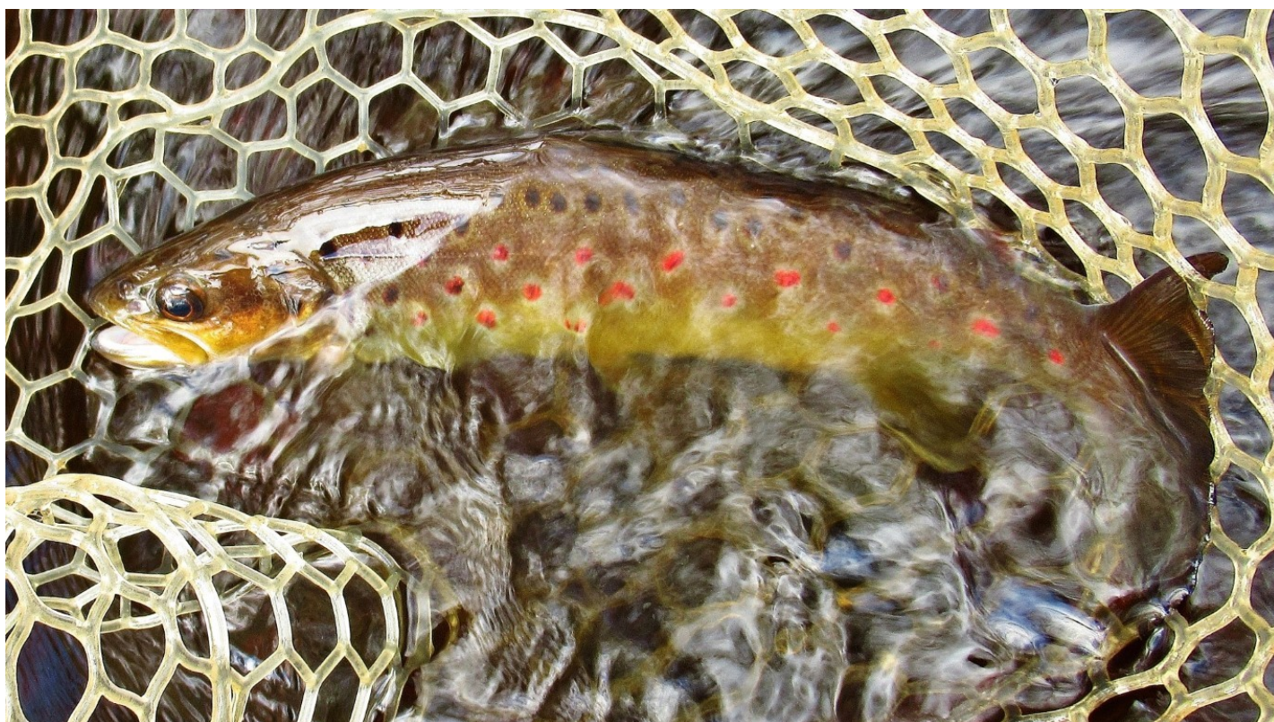
My 400 th trout of the 2019/20 trout season..