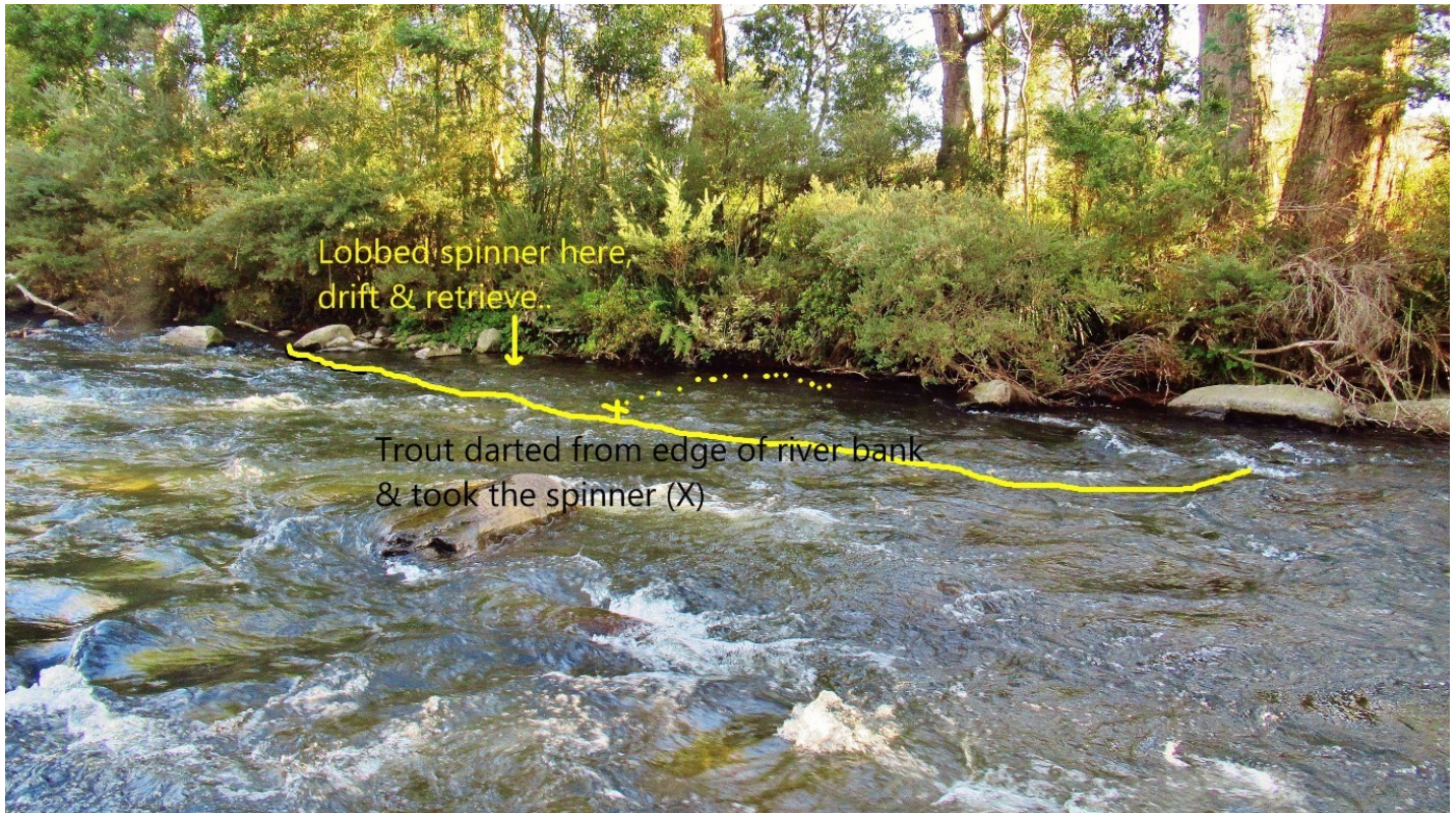
The fast waters of the Meander River was the best for chasing trout.

This season I only had three trips to the Dasher River with very little success, for some unknown reason the trout numbers were well down to what they normally are. I know three trips doesn't say why the trout were low in numbers either, but the trout just weren't there. On my first trip on the 16/9/19 did catch and release eight small browns, the following trip two weeks later I was lucky to catch the one trout and it was the only one I came across. On those two trips the water level was very low and the river itself wasn't in very good condition either. There is one property owner that has never replaced the cattle/sheep fences that were washed away back in 2016. Without the fences the cattle are in the river doing there thing and I'm sure the pollution & river bank damage they're doing to it isn't helping the trout's cause at all. After those two early season trips I didn't venture back there until the last day of the season when I fished the river above Claude Road. There was good flow because of recent rains but the trout were scarce and all I managed was two small browns from five hook ups. Hopefully the river will recover during the closed season, low water levels throughout the season may also have had an effect on this great little river.