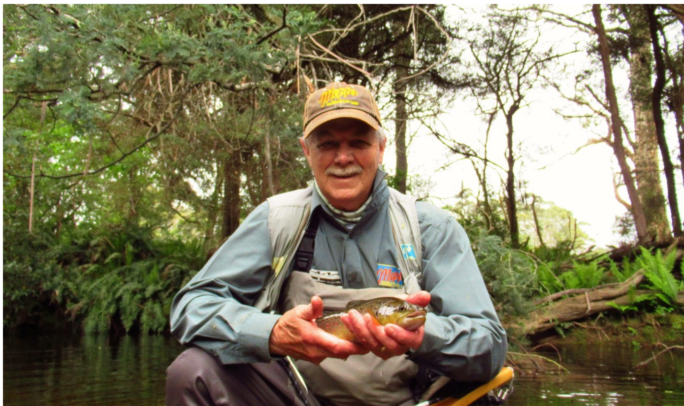
My 10,000 th trout since moving to Tasmania in March 2000 was caught in a small tannin stream.