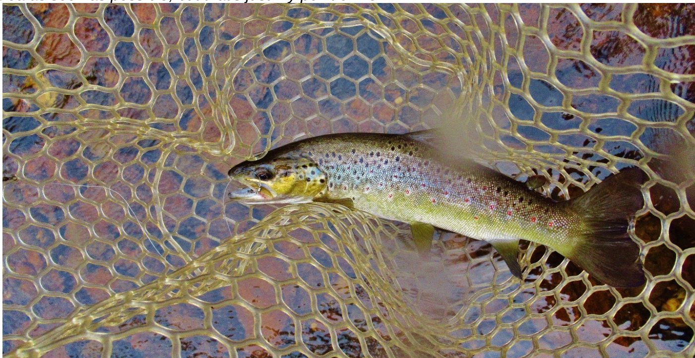
A nice few & far between well conditioned Leven River wild brown trout..

the spinner. That was the only trout seen in all that time in the two areas fished that day. I have spoken to others who have fished the Leven and they too have just about given up on fishing it. This was always one of my favourite rivers to fish for a long time, but now I have to write it off as one of my worst rivers. I still love being in it because of its beautiful scenic surrounds and tannin coloured waters, it's still a natural water without any dams on it, just a shame the trout are not there now like they used to be.. I feel stocking program should be introduced in the upper Dobson's Flat area as soon as possible, but that's just my point of view.